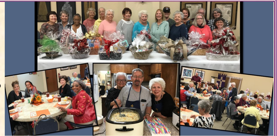
Baskets galore and the best stew luncheon

The choice for the stew luncheon is either chicken or beef stew. Both come with cornbread, a roll and dessert. 🍲