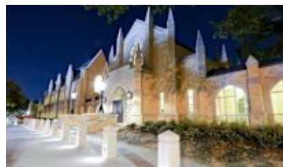
Church of the Incarnation, Dallas

The service will be offered via live-stream at the diocesan website at www.edod.org . The link will be forthcoming. †